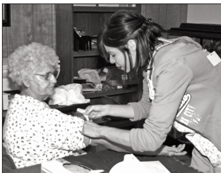
Health screenings are always a very valuable and popular feature of the SVEC Senior Expos.

For a limited time, TVA will mail an energy conservation kit to you upon completing a do-it-yourself energy audit. Visit www.energyright.com or www.svalleyec.com to complete the survey online or request a mail survey; or call your local SVEC office to have a survey mailed to you.